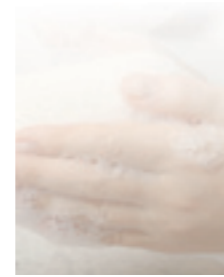
DETERGENTS, CLEANING PRODUCTS & BODY CARE PRODUCTS