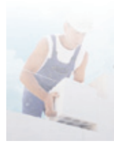
BUILDING MATERIAL & LIME